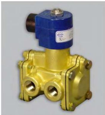
3-WAY PILOTED DIAPHRAGM | S20 SERIES 3/8", 1/2" NPT BRASS