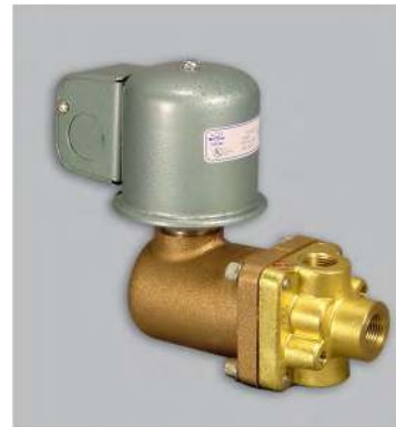
3-WAY OIL RECIRCULATING | K13 SERIES LEVER ACTING 3/8", 1/2", 3/4" NPT BRASS