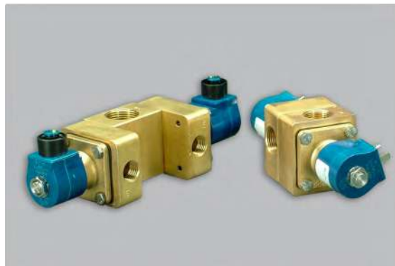
3-WAY HIGH FLOW | M20 M21 SERIES 3/8", 1/2", 3/4" NPT STAINLESS STEEL | BRASS | NORYL