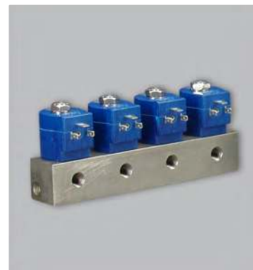
SPACESAVER MANIFOLDS S30 S31 S40 C4 C9 SERIES STAINLESS STEEL | BRASS | ALUMINUM | POLYMERS